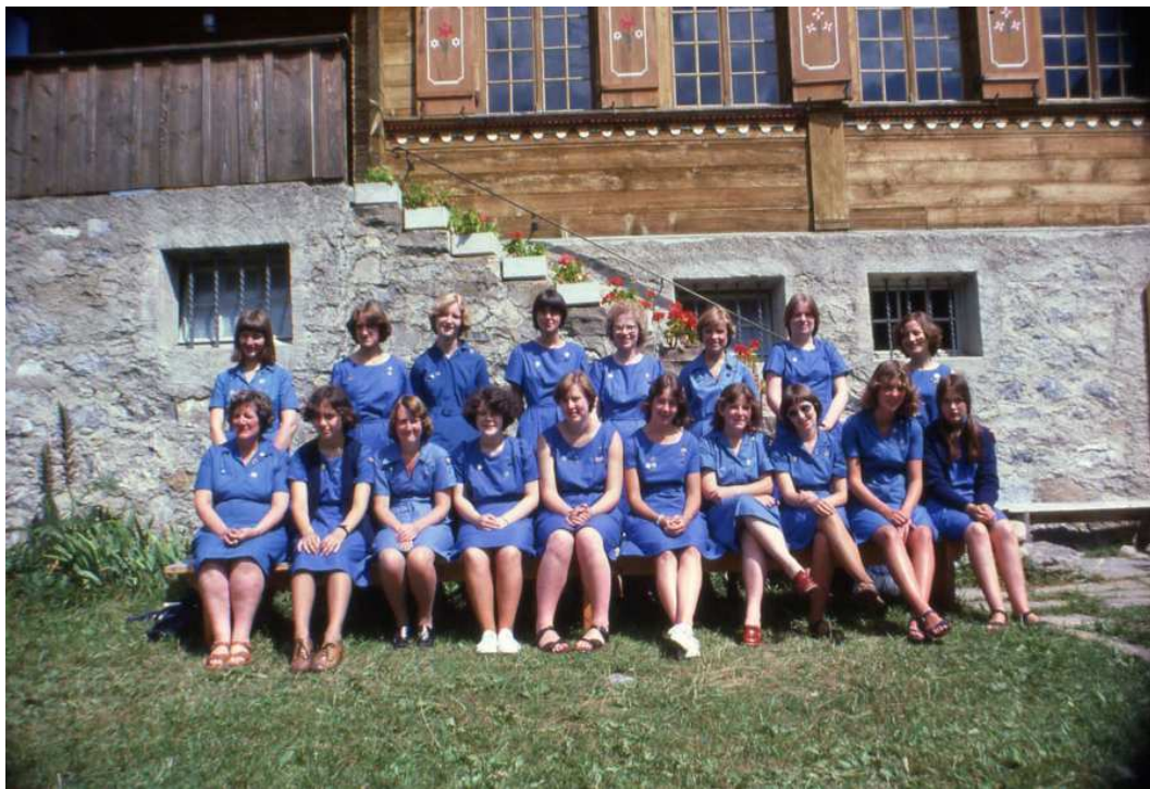
Rangers from Wesley outside the Girl Guiding World Centre "Our Chalet" in Adelboden, Bernese Oberland, Switzerland in August 1977.